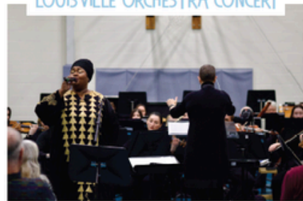
LOUISVILLE ORCHESTRA CONCERT