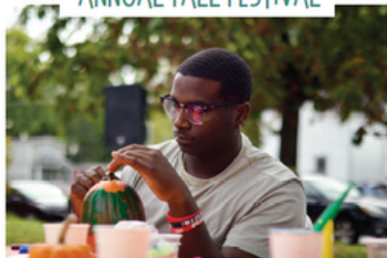
ANNUAL FALL FESTIVAL