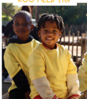
ZOO FIELD TRIP