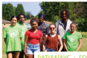
PATHWAYS + FOOD LITERACY PROJECT